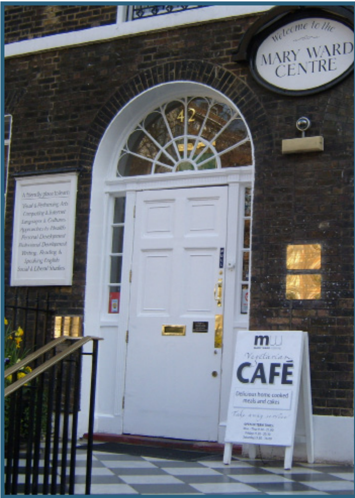
42 Queen Square, London, WC1N 3AQ A Georgian building in Bloomsbury with a range of beautiful teaching, meeting and event spaces