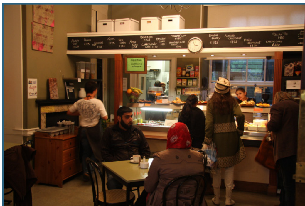
The popular vegetarian café at the Mary Ward Centre in Queen Square