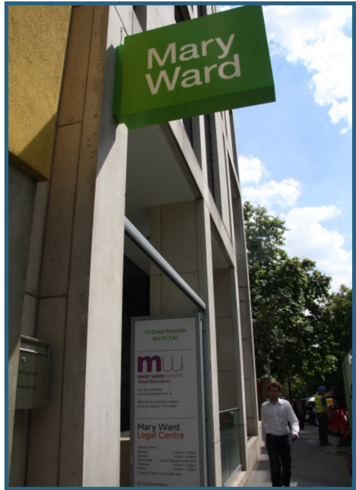
10 Great Turnstile, London, WC1V 7JU Our newly refurbished modern building in Holborn, with light, spacious classrooms and a great studio space